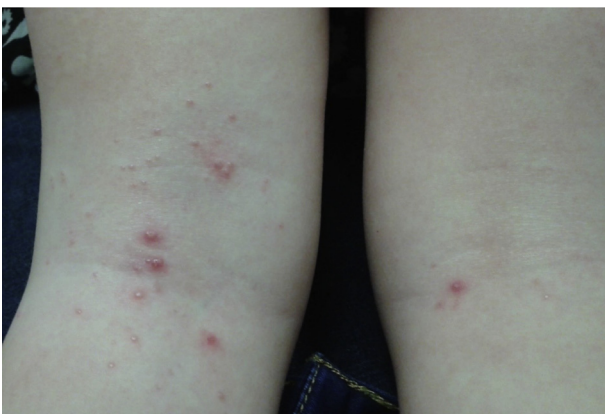
Figure 5. Molluscum contagiosum along with the flexural areas of a patient with atopic dermatitis.