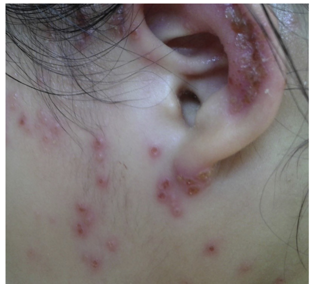
Figure 3. Eczema herpeticum.

Impetigo, cellulitis, and skin abscesses are common SSTIs in AD. The most common cause of these infections is S aureus . Impetigo