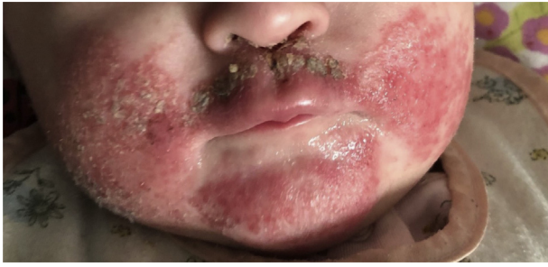
Figure 2. Impetigo in a child with atopic dermatitis.

recent study using a newer sequencing method (massively parallel sequencing) also found a relatively high prevalence (15.3%) of FLG LoF among African American children with AD. 10 This prevalence is significantly higher than the 5.8% that was previously reported. 10 Patients with AD with FLG LoF had a 7-times higher risk of having 4 or more episodes of skin infections requiring antibiotics within 1 year than patients with AD without FLG LoF. 2 FLG LoF also confers a significantly higher risk for EH in patients with AD. 2 Lipids in the stratum corneum of patients with AD have been found to differ substantially in composition from those of healthy individuals. Patients with AD have decreased expression of fatty acid elongases that contribute to observed changes in skin lipids and interleukin (IL)-4 and IL-13, having an inhibitory effect on these enzymes. 11 In addition to physical barrier defects, AD is also known to have a deficient chemical barrier that comprises innate defense molecules including \beta -defensin 2 and cathelicidin. 2