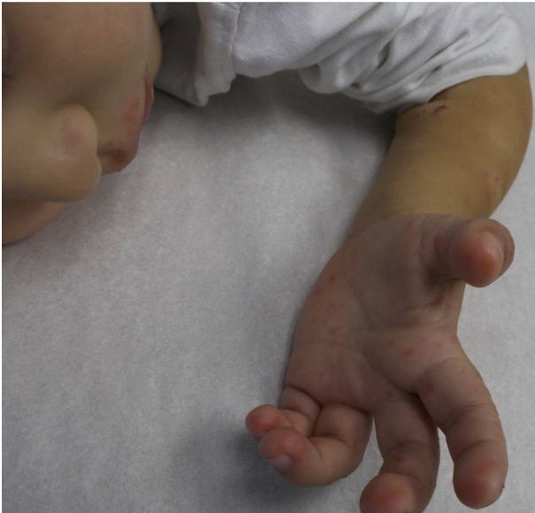
Figure 4. Eczema coxsackium with palm lesions.